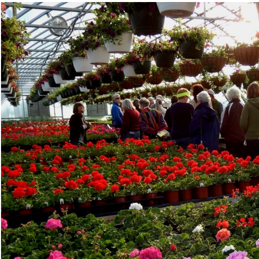
NRV MGs tour Crows Nest Greenhouses.