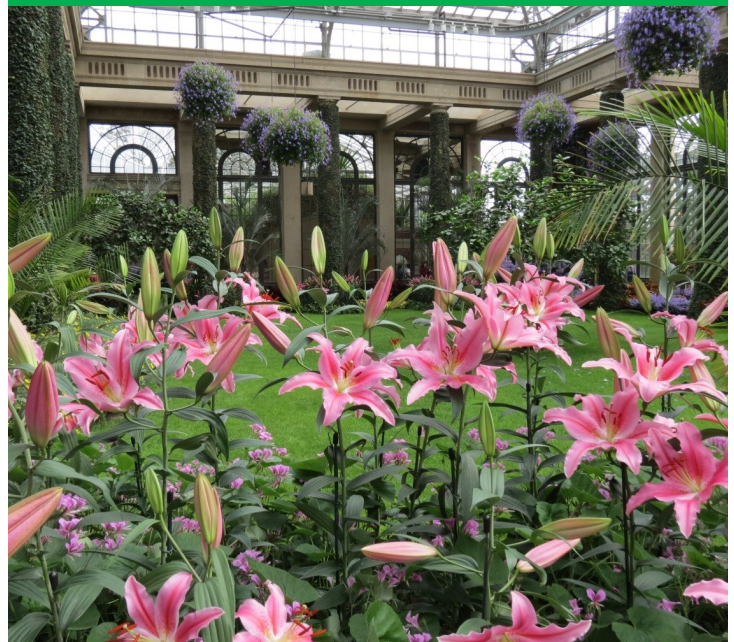
Longwood Gardens Conservatory.

I look forward to a return trip to tour the grounds in summer.