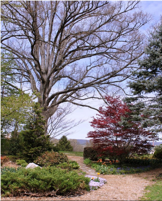
International Peace Garden at Virginia Tech.