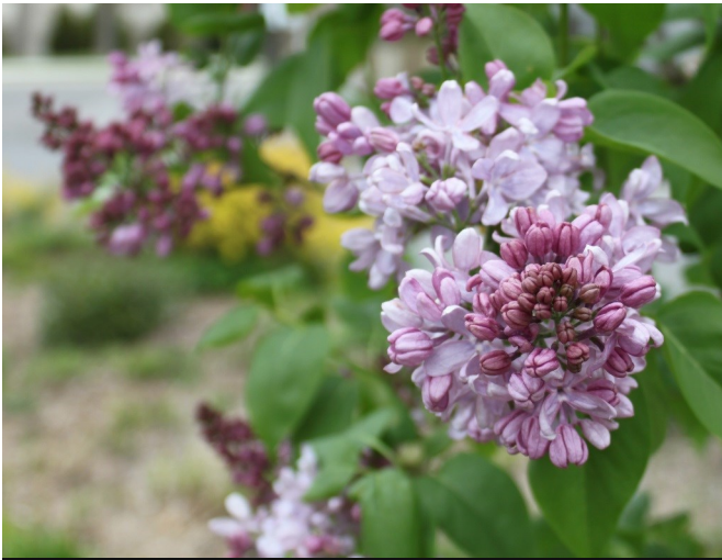
Lilac in bloom at the Hahn Garden.