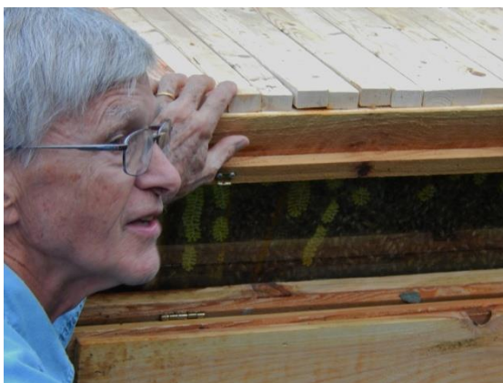
Hive filled with honeybees.